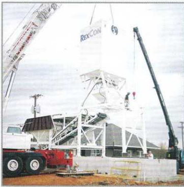
Hinged, gravity feed cement silo