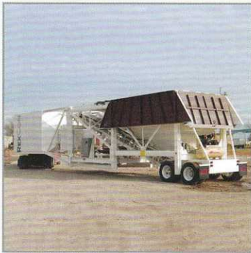
Single trailer transport