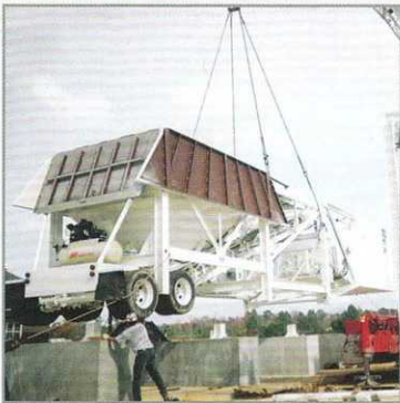
Portable or stationery installation